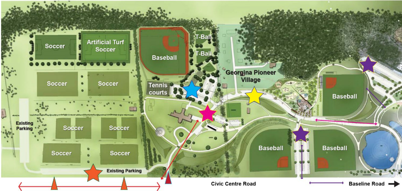
Georgina Marathon/Half-marathon race site proposed layout – Sunday, Oct. 17, 2021