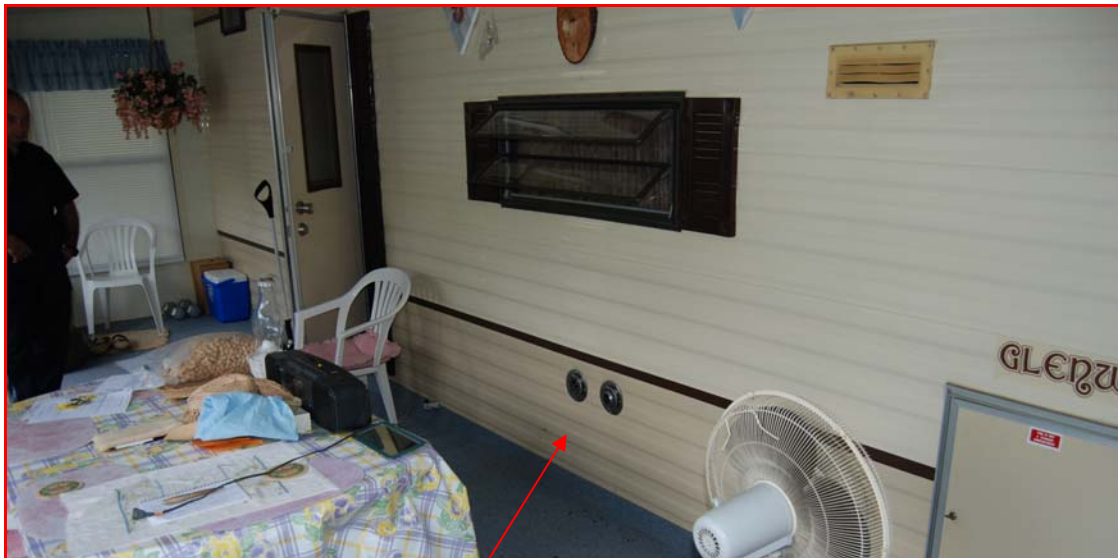
INLET AND EXHAUST TERMINATION

CO is a colourless, odourless gas often produced in conjunction with the combustion of fuels such as propane, natural gas or fuel oil. The combustion products from appliances, such as trailer heaters, are vented to the outside through a vent on the external trailer wall (see photo below). If the exhaust is trapped in an enclosed space, any occupant could suffer toxic CO exposure.