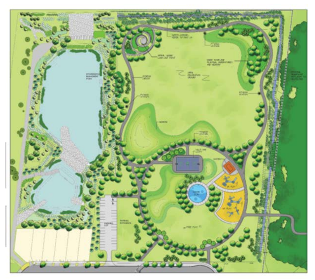
The Subdivision Park Concept.

Recognize the site as a key destination of the Town Trail Systems for the Sutton Area connecting to Baseline Road, Dalton Road Black River Road and the Sutton Multi-Use Facility. Build in facilities for trail users including trailhead signage, bicycle parking and service facilities.