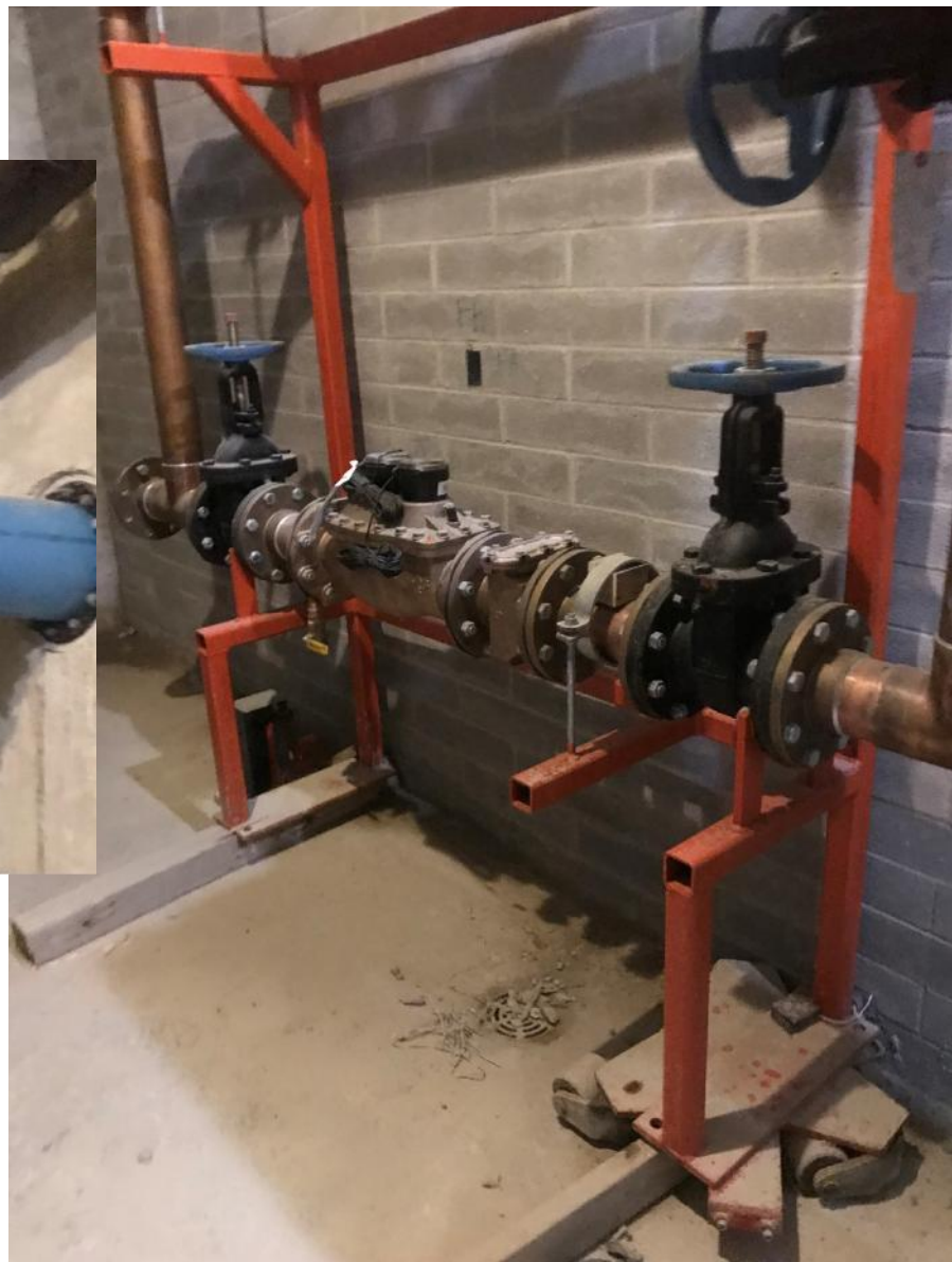
Basement stair, incoming water room