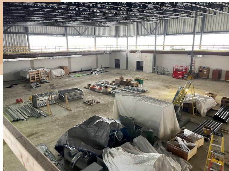
View of Gymnasium