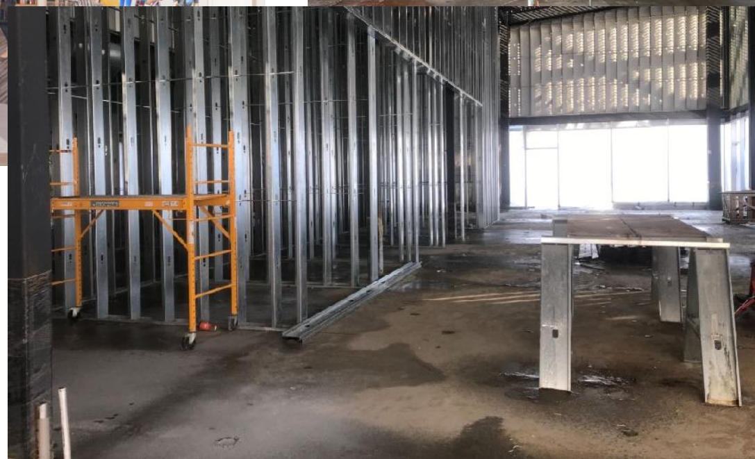
View of Discovery Branch Library