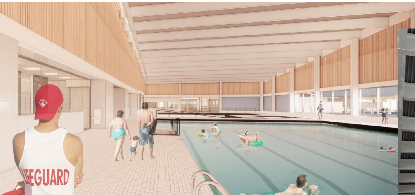
View of Pool