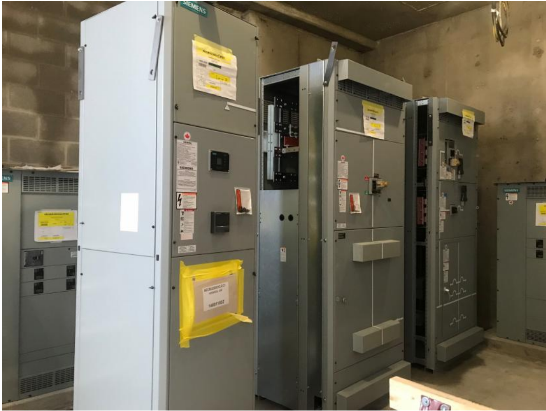
Electrical room, incoming water room