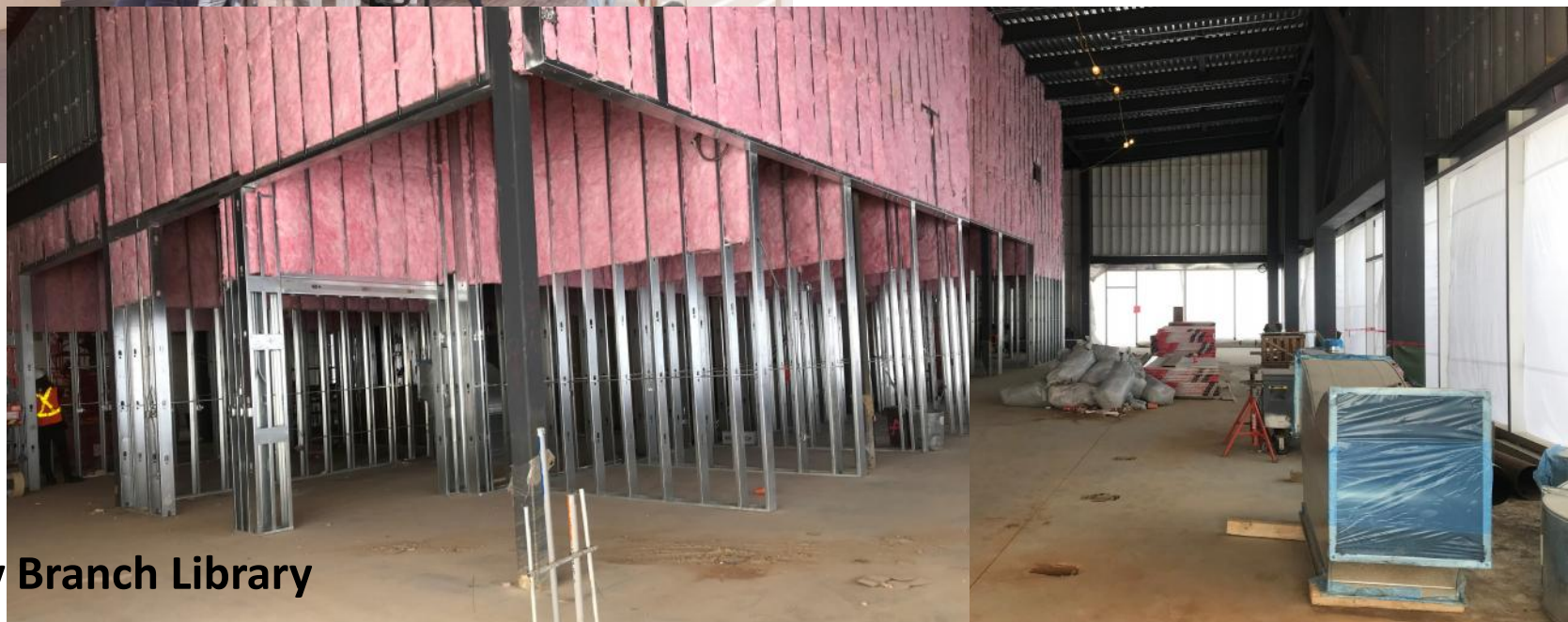
View of Discovery Branch Library