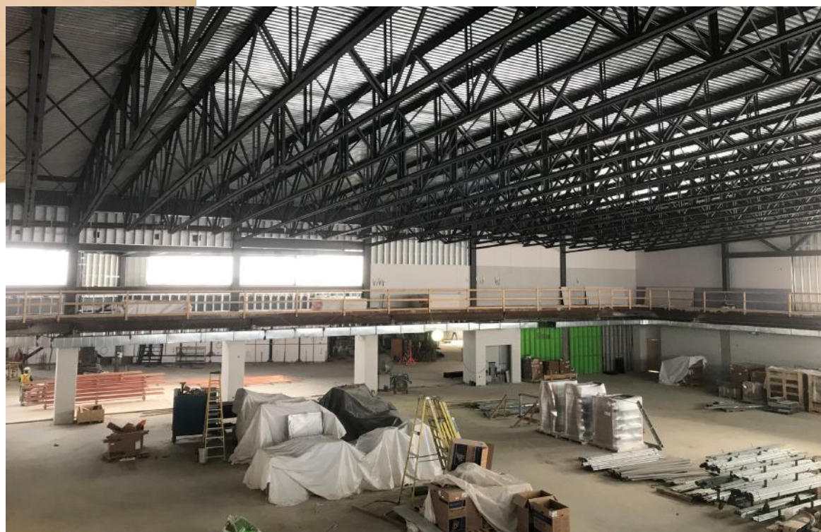
View of Gymnasium