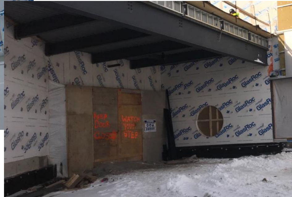
Exterior- North - East