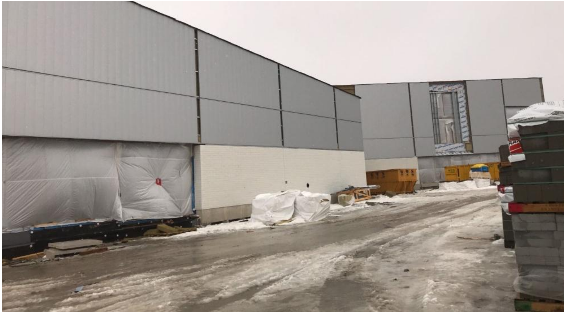
Exterior- North - West