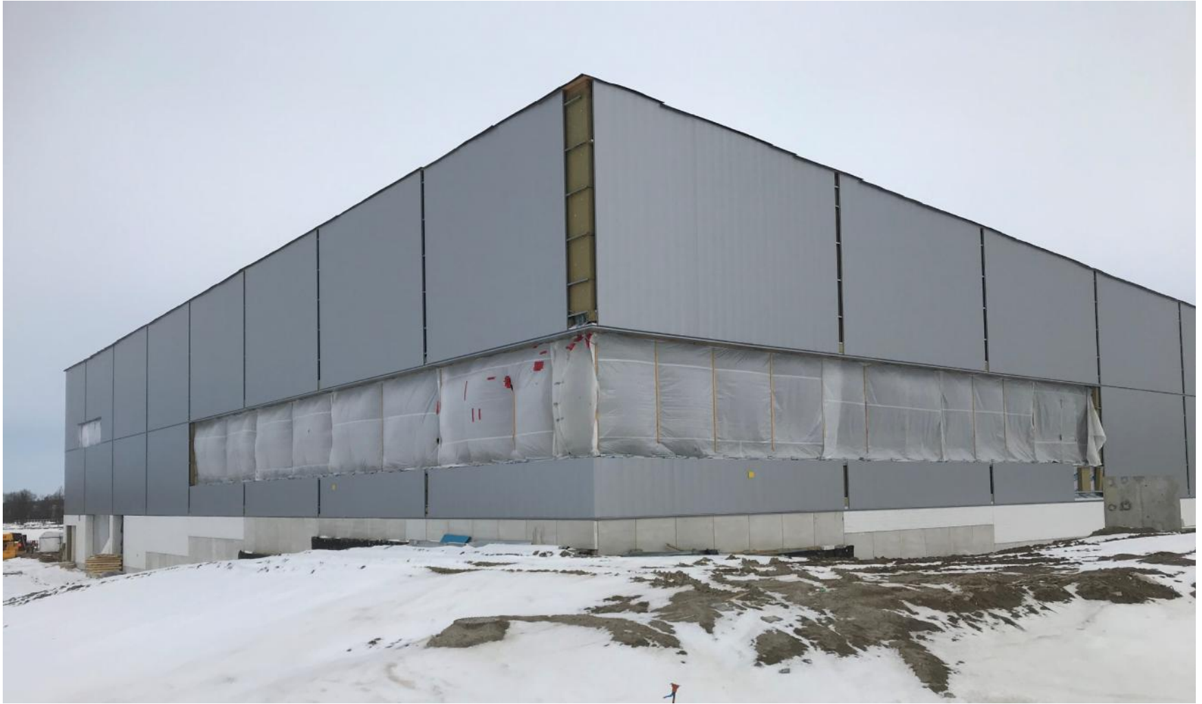
Exterior- South - West