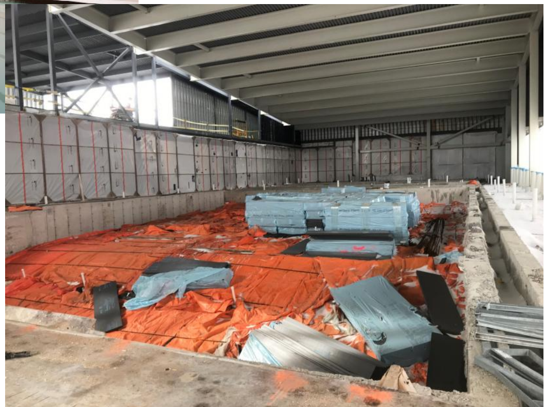
View of Pool