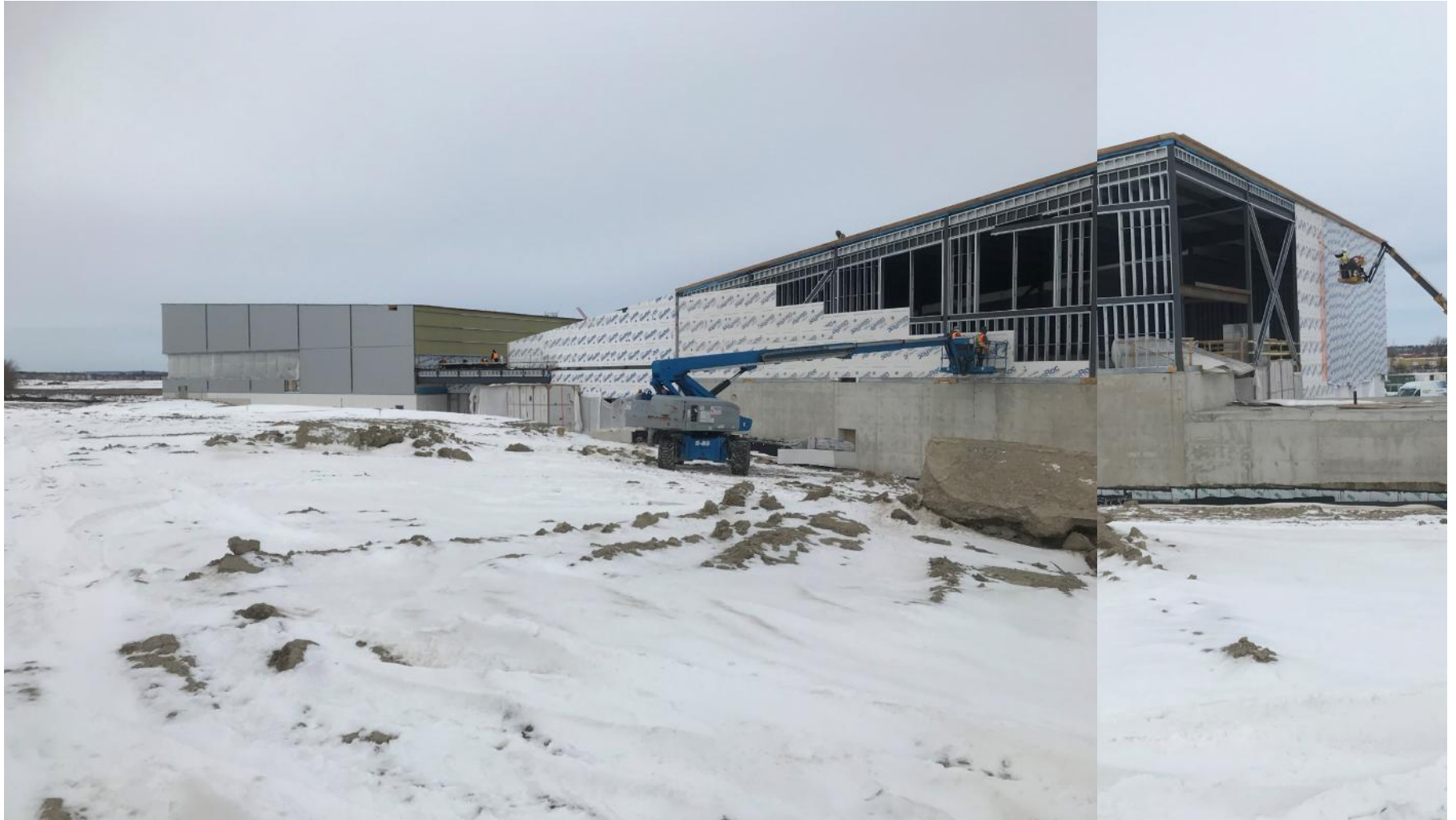
Exterior- South - East