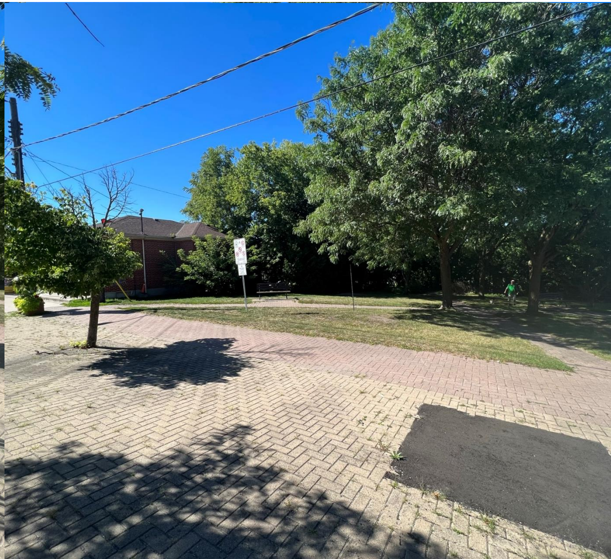
Existing Conditions August 2022