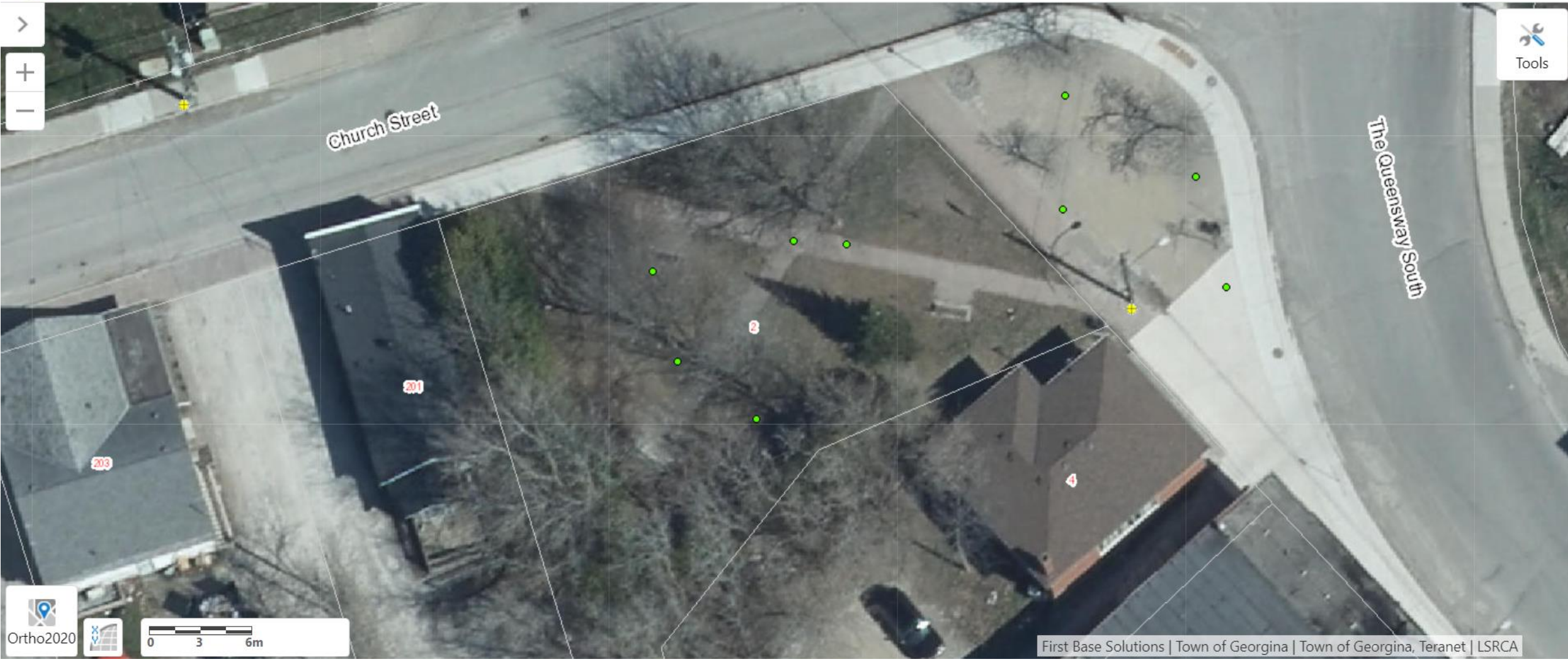
Existing Conditions August 2022