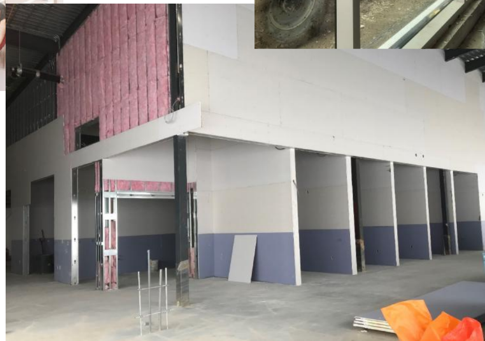
View of Discovery Branch Library