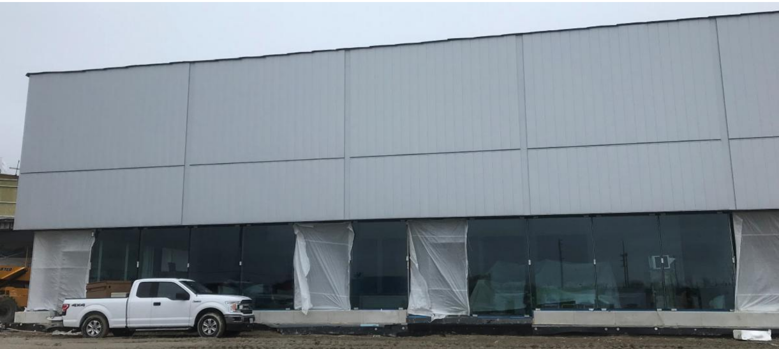
Glass for exterior walls