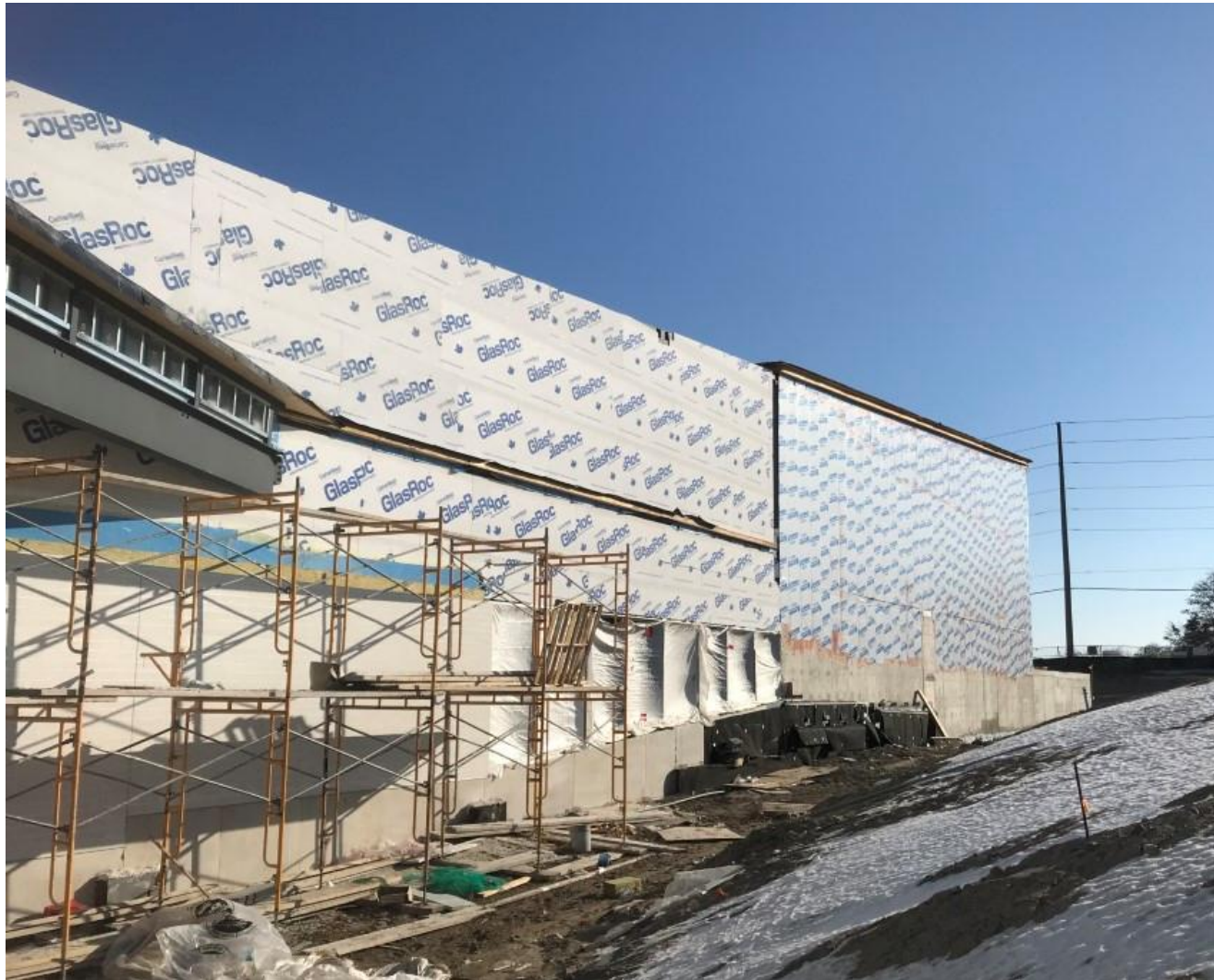
Exterior- South - East