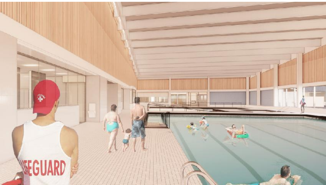
View of Pool