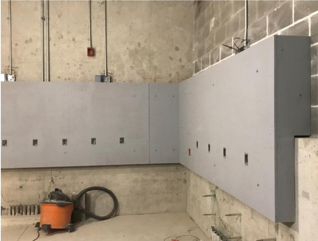
Incoming IT, Electrical and communications rooms