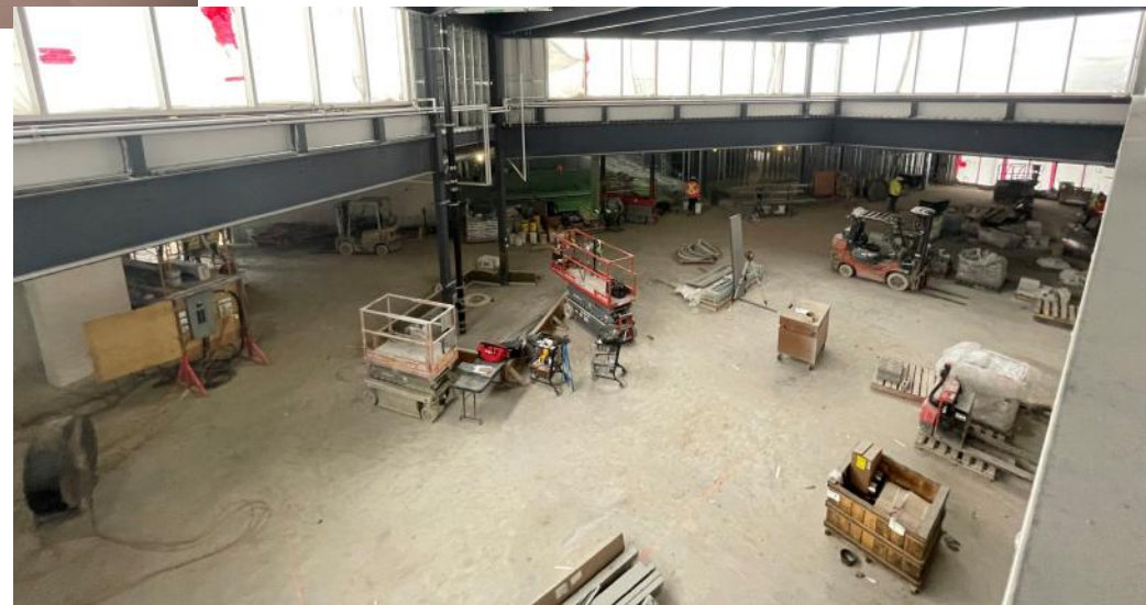
View of Lobby