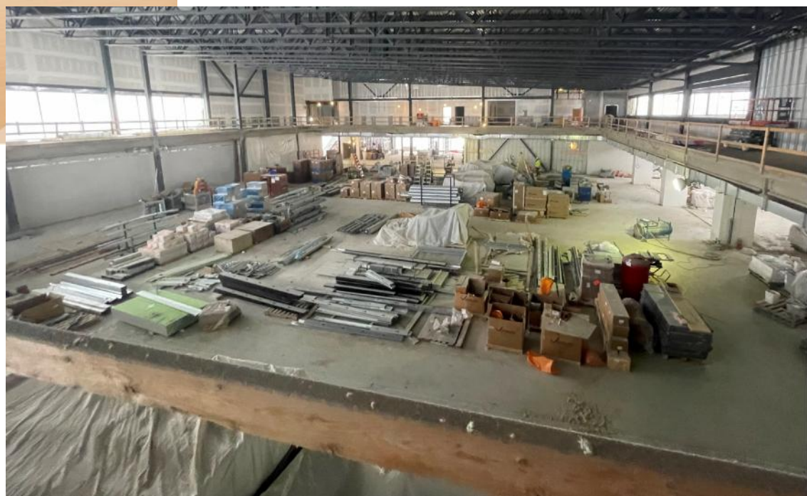
View of Gymnasium