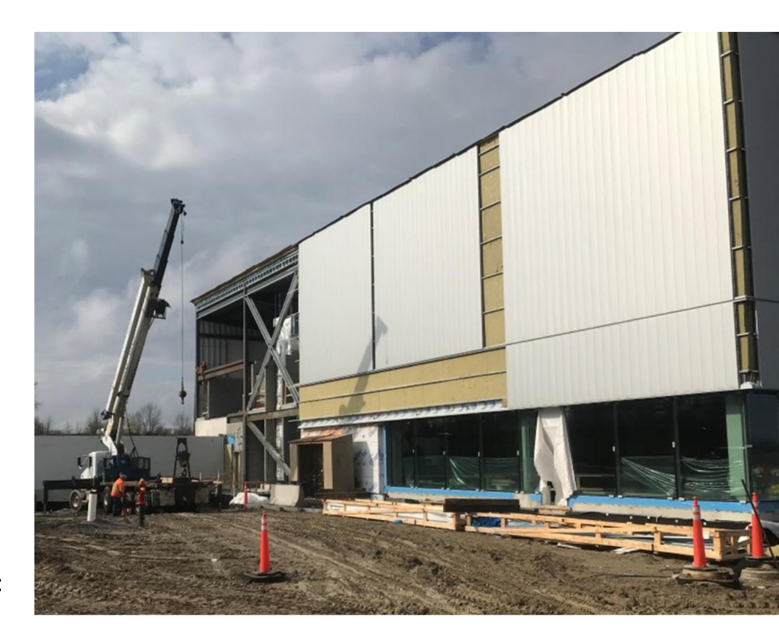
Exterior- South - East