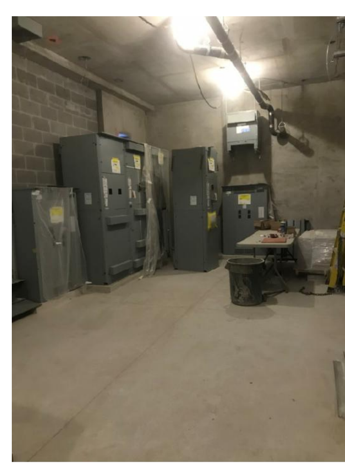
Incoming IT, Electrical and communications rooms