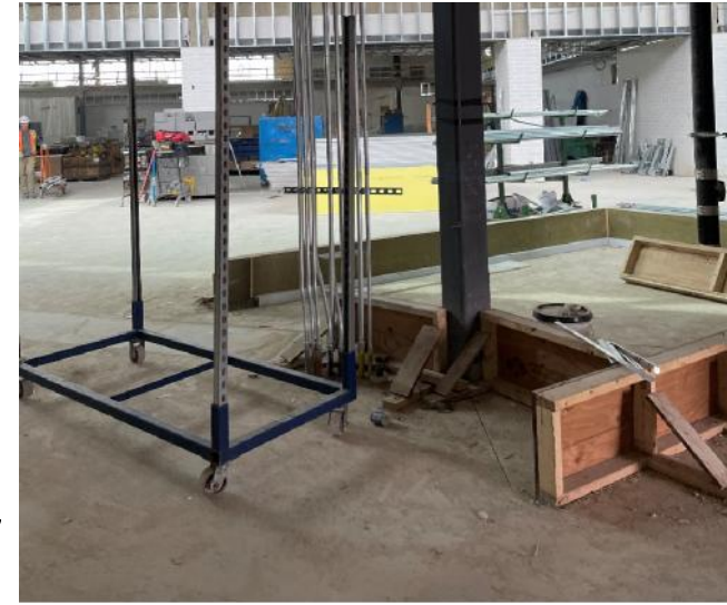
View of Lobby