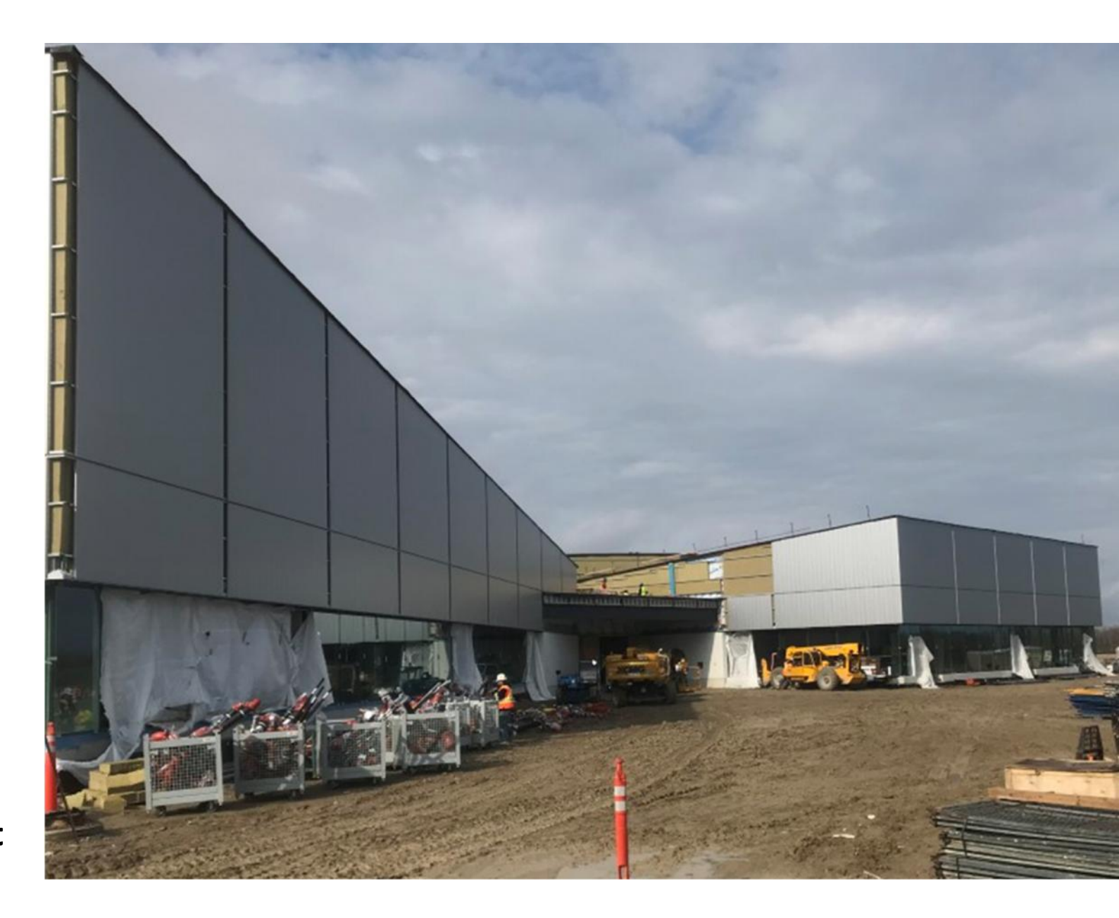
Exterior- North - East