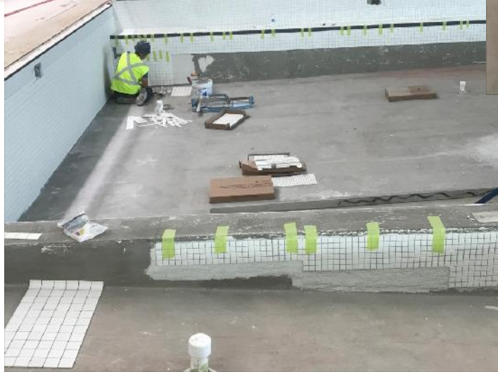
View of Pool