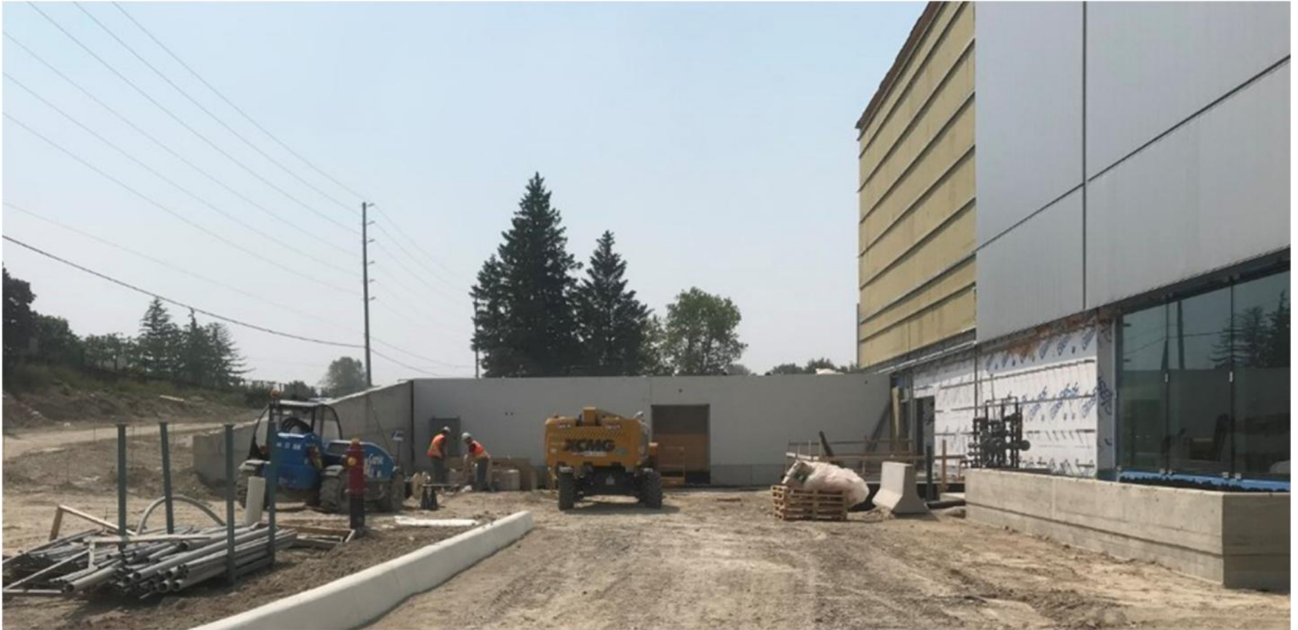
Incoming electrical in progress