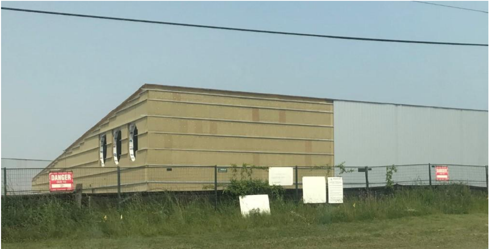
Exterior- South - East