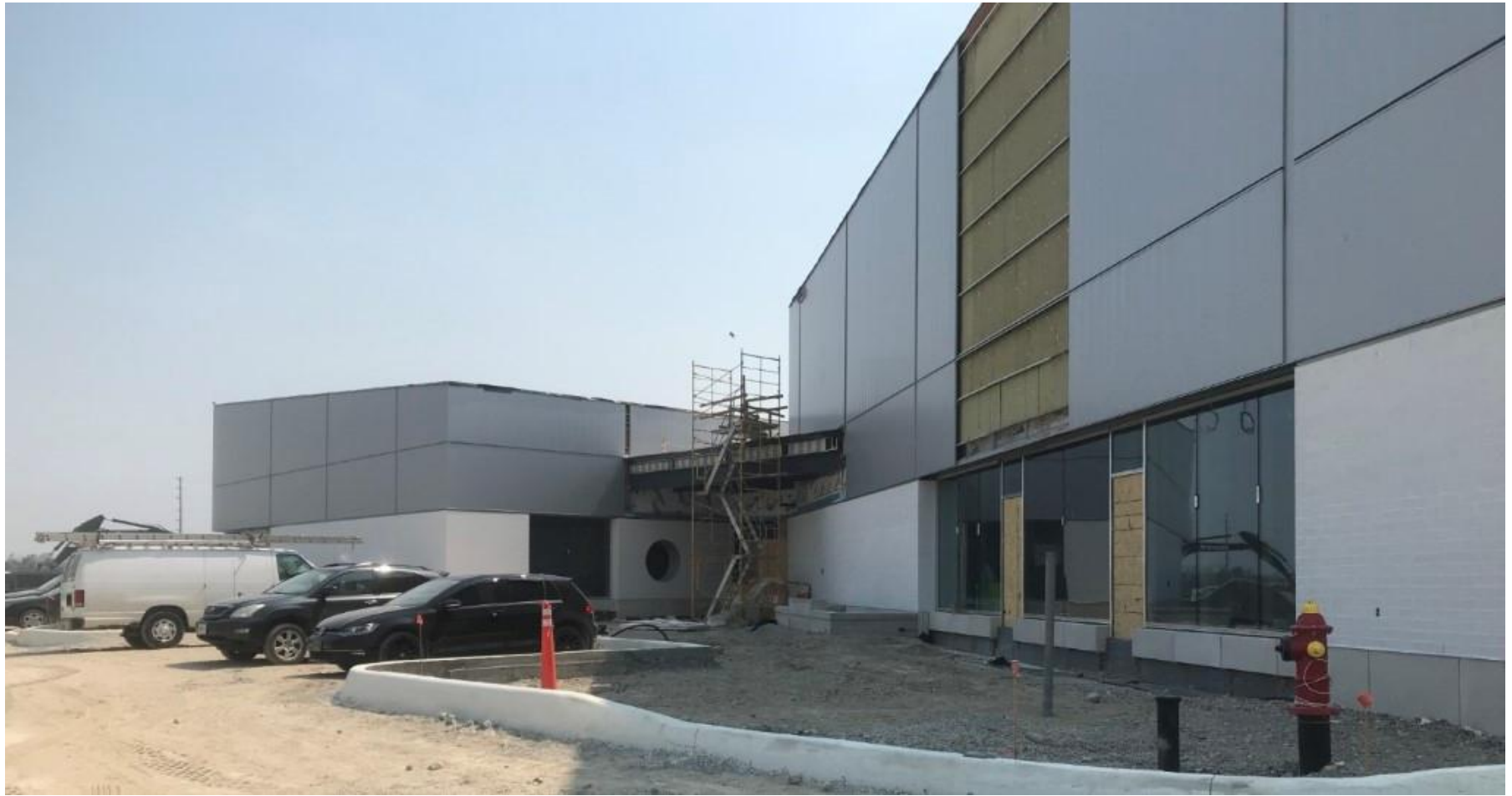
Exterior- North - West