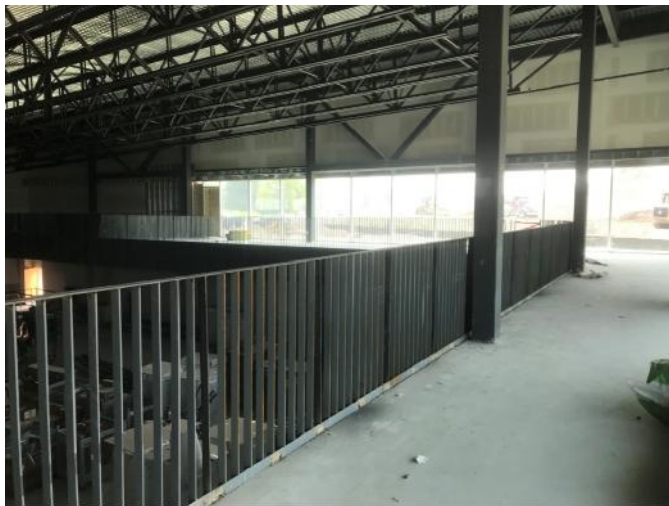
View of Gymnasium