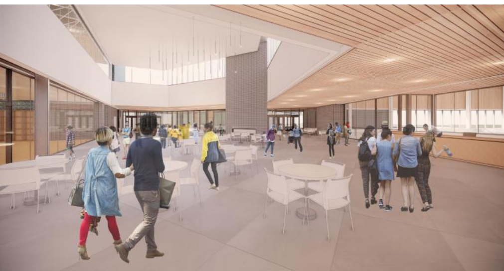
View of Lobby