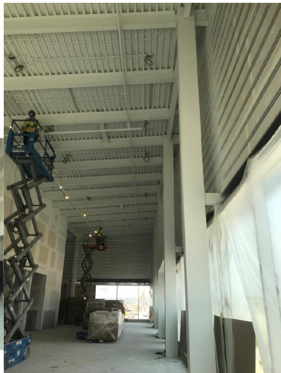
View of Discovery Branch Library