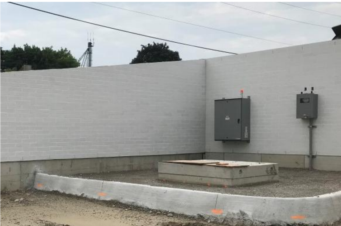
Incoming electrical in progress