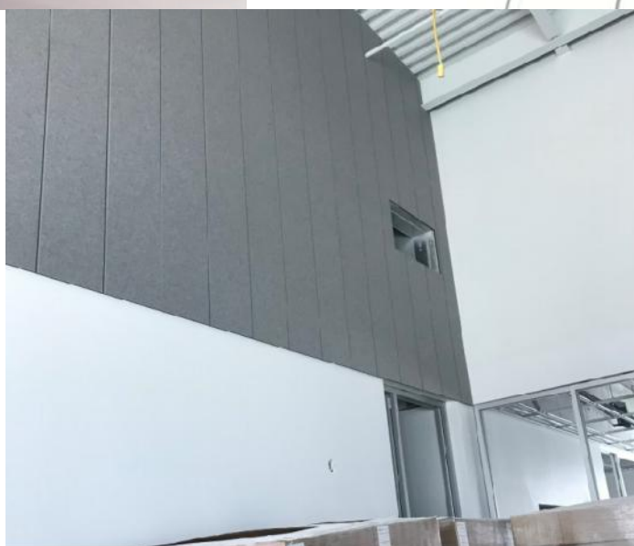
View of Discovery Branch Library