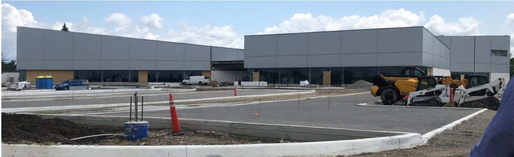
Exterior- North - West