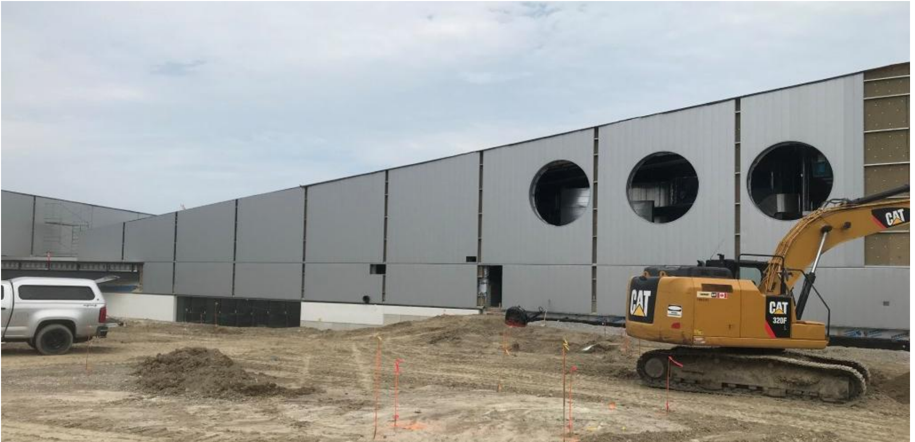
Exterior- South - East