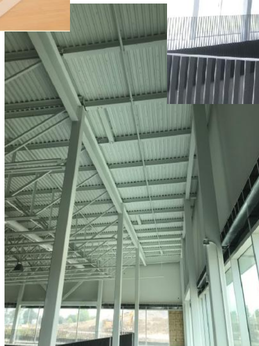
View of Gymnasium