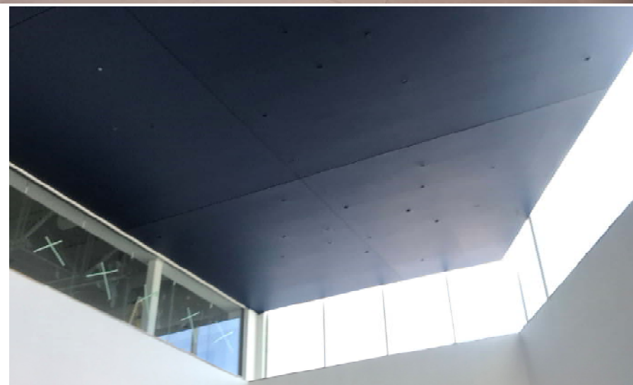
View of Lobby