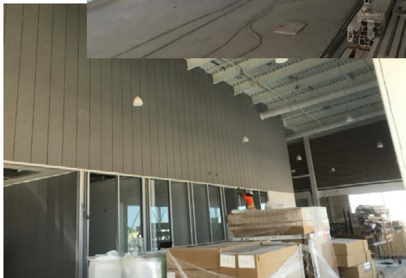
View of Discovery Branch Library