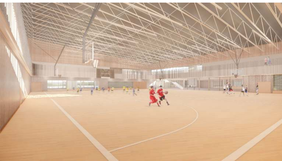
View of Gymnasium