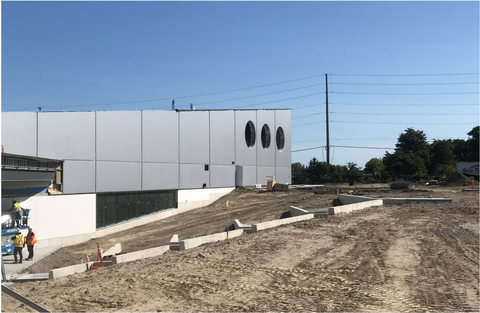
Exterior- South - East