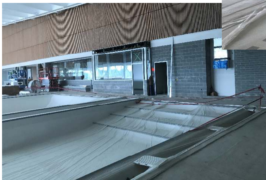
View of Pool