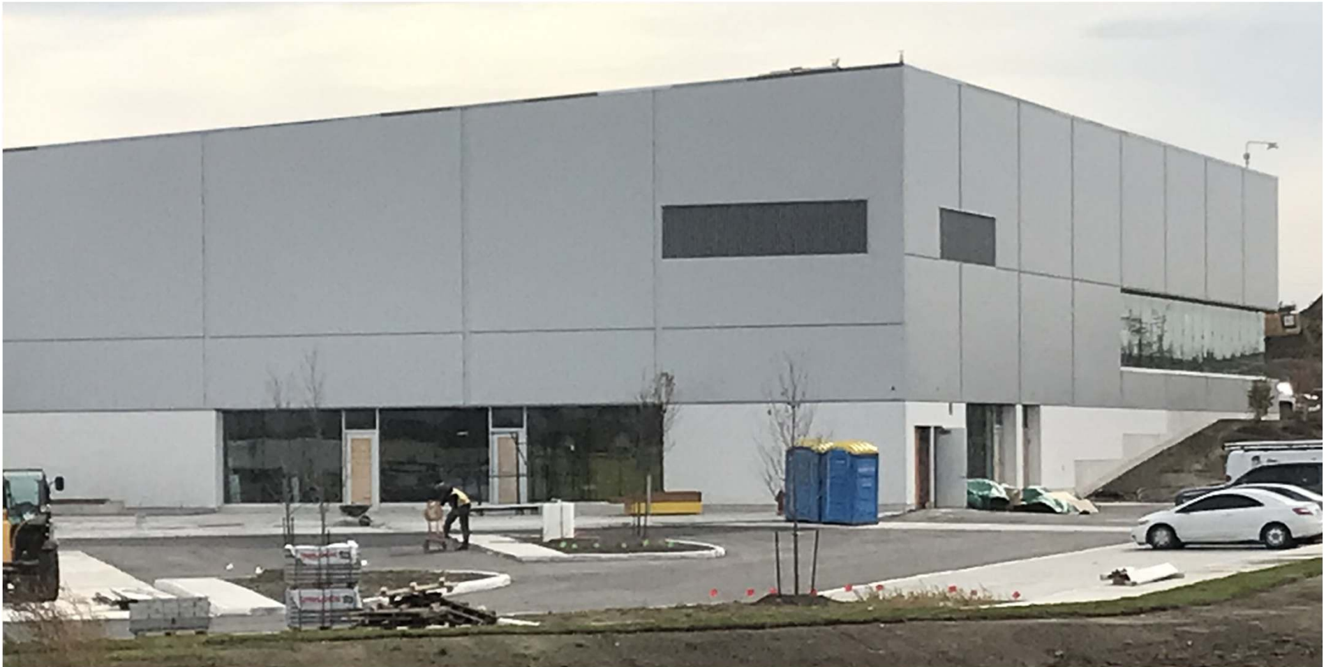
Exterior- North - West