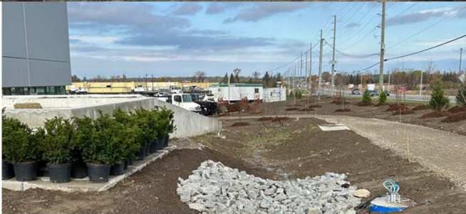
Exterior- South and south east