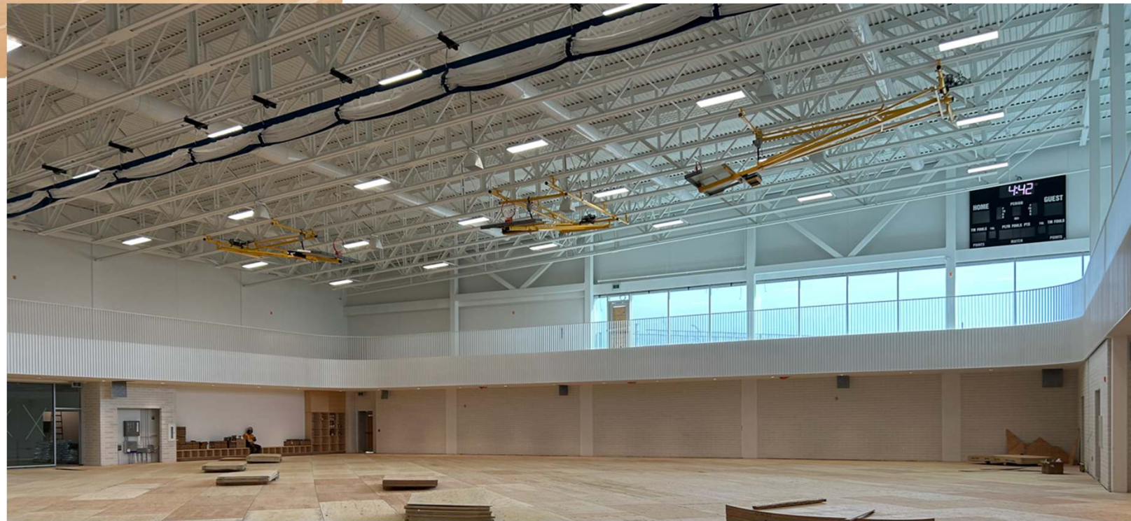
View of Gymnasium