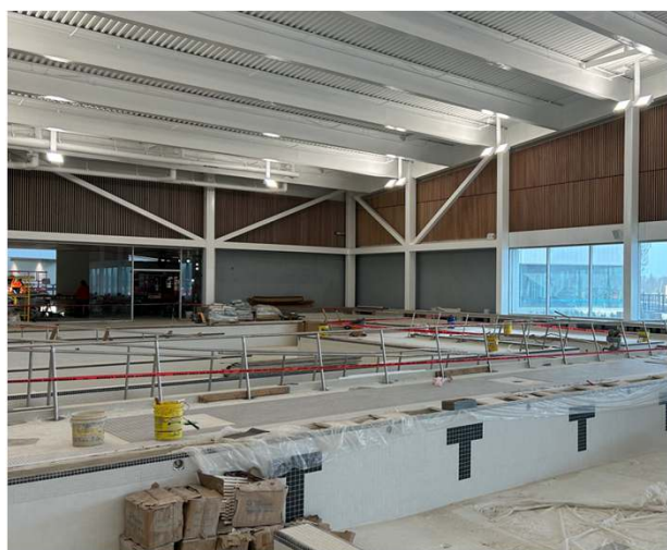
View of Pool