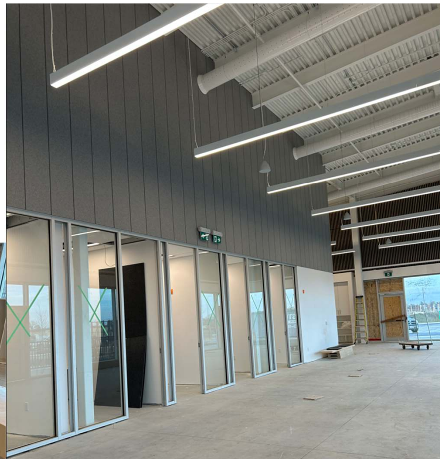
View of Discovery Branch Library