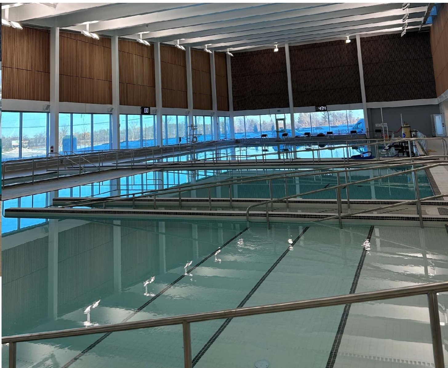
View of Pool