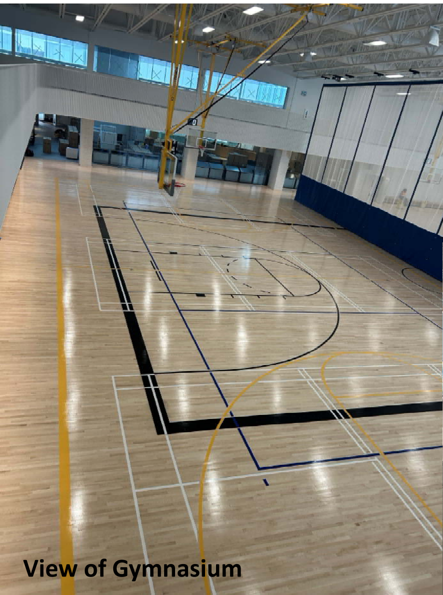
View of Gymnasium