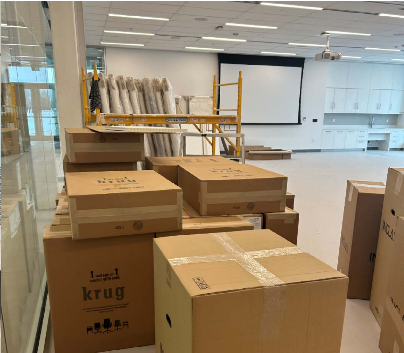
ew of Multi-purpose rooms