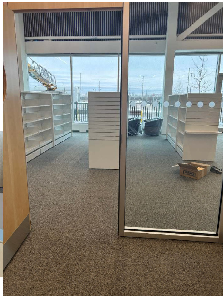
View of Discovery Branch Library