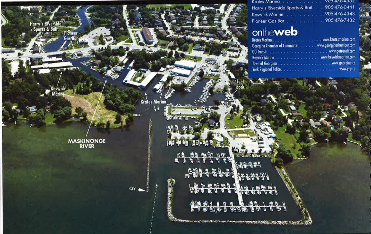
Chart 2028: Krates Marina, a 500-slip facility sits on a 40-acre complex at the mouth of the Maskinonge River.

WAYPOINT # _____ 0.4 kilometre (¼ mile) N of entrance to Maskinonge R.: 44°13.55'N; 79°28.75'W