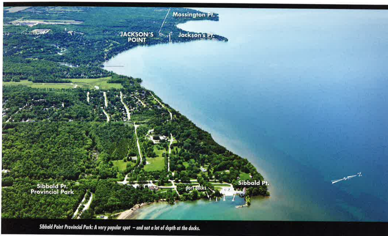
Sibbald Point Provincial Park: A very popular spot – and not a lot of depth at the docks.