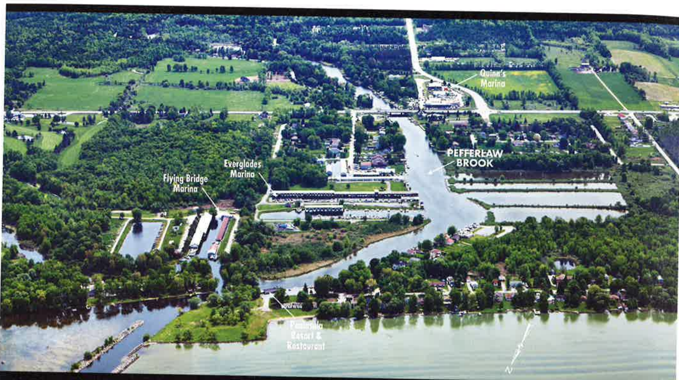
The first two marinas and the resort have overnight dockage. Quinn's offers service only, no dockage.