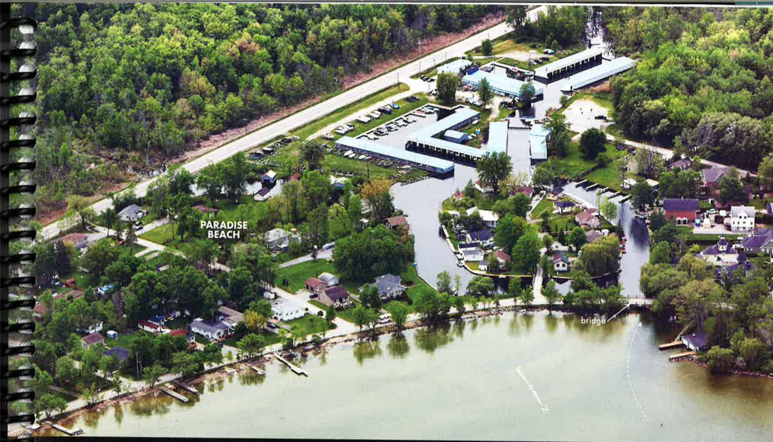
Paradise Beach: The marina here was out of business as of our press time (2016).