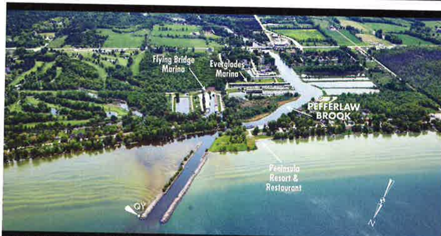
Peninsula Resort & Restaurant offers two hours of free docking to patrons. Flying Bridge and Everglades marinas both welcome transient boaters.