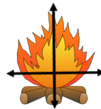
2 ft x 2 ft