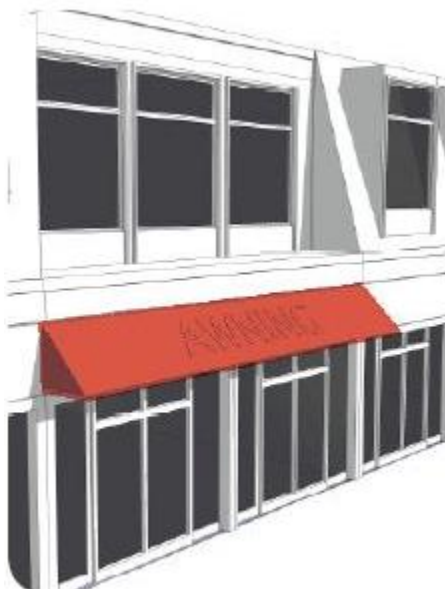
awning placement on storefront