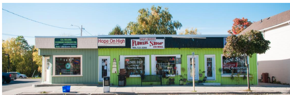
Vinyl & metal siding is discouraged.