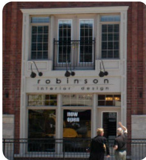
signage should not obscure window

3. To minimize visual clutter, signage should be integrated into the design of building façades wherever possible, through placement within architectural bays and friezes.