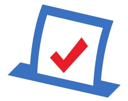
Monday, October 27, 2014